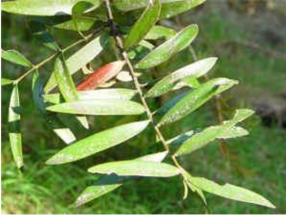
Picture: Elongated leaves of young Kauri.

Young Kauri have different leaves and shed their branches.